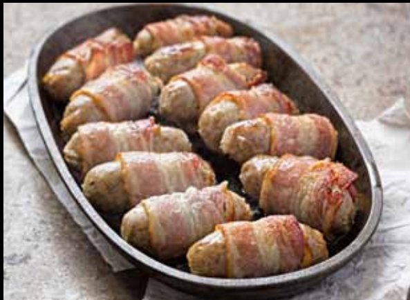
Pigs in Blankets Traditional pork chipolatas wrapped in dry cured streaky bacon £4.99 per pack