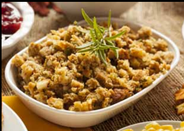
Pork & Cranberry Stuffing 454g/1lb tube £3.99