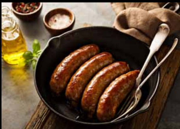
Traditional Old English Sausages £9.99 per kg